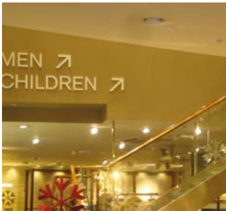
Interior Wayfinding Signage

Next International has more than 180 stores throughout continental Europe, Scandinavia, Russia, the Middle East, India and Japan.