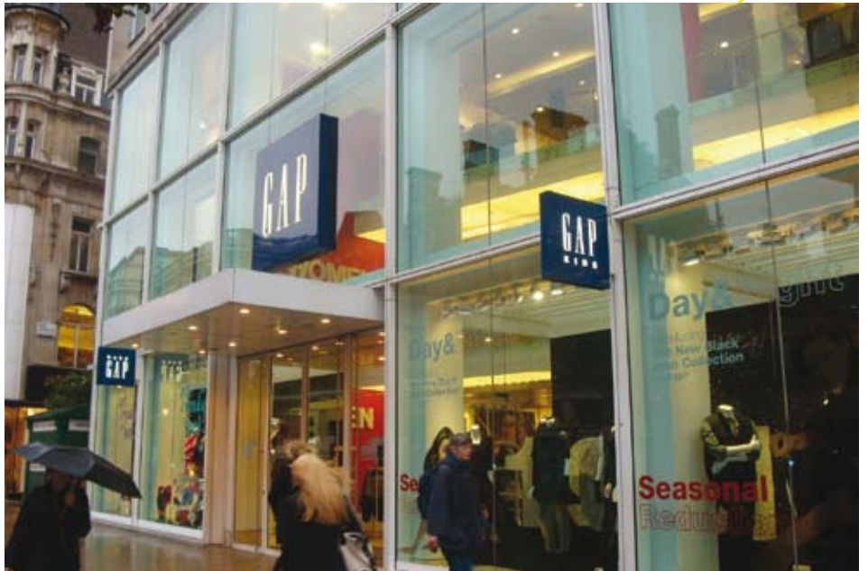
Oxford Street Flagship Store