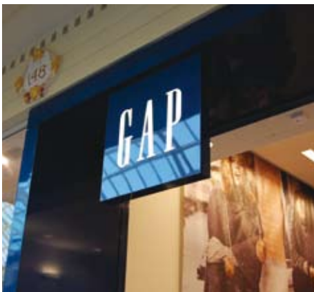
Gap Trafford Centre Portal Signage

Born out of his frustration of not being able to find a store that sold a pair of jeans in his size, Don Fisher opened the first store in San Francisco in 1967. The first UK store was opened in London in 1987.