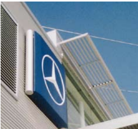
Main dealership branding

IMM Network work with many major brands in the industry such as, Lambourghini, Mercedes-Benz, Bosch, Fiat and VW.