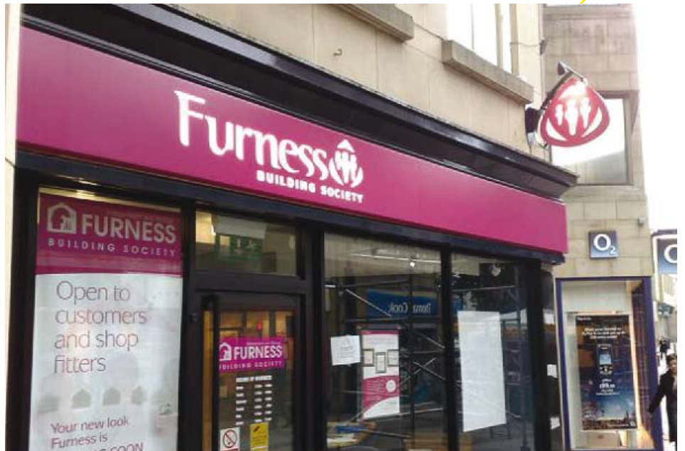
Lancaster Branch Exterior Signage