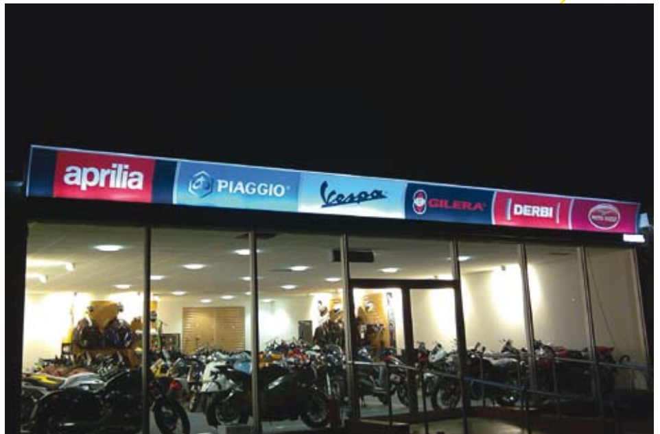
Dealership Exterior Signage