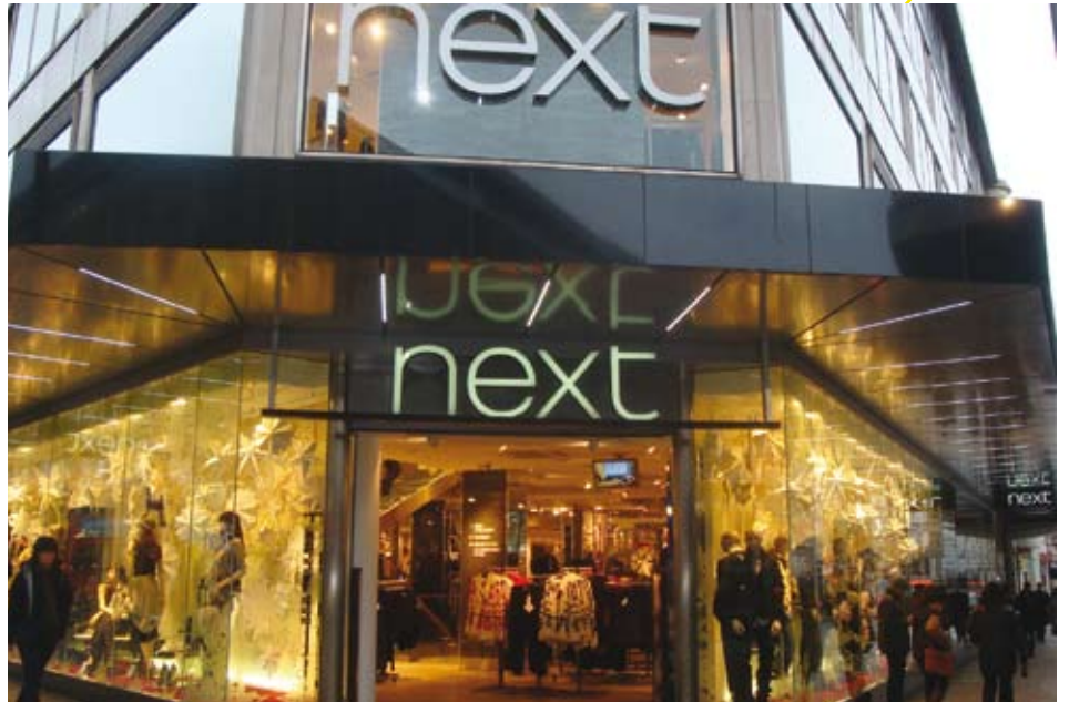
Bond Street Exterior Signage