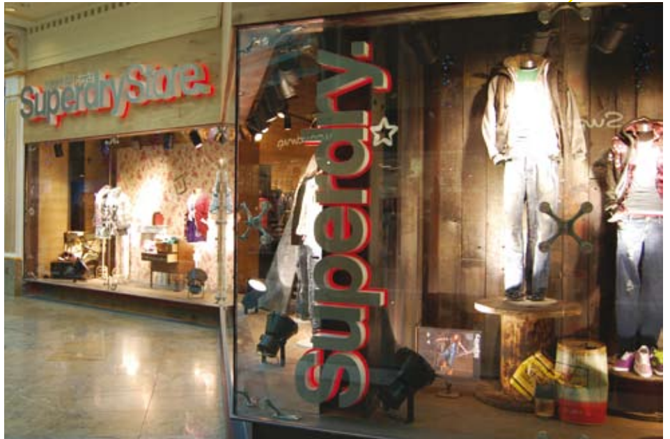
Trafford Centre Exterior Signage