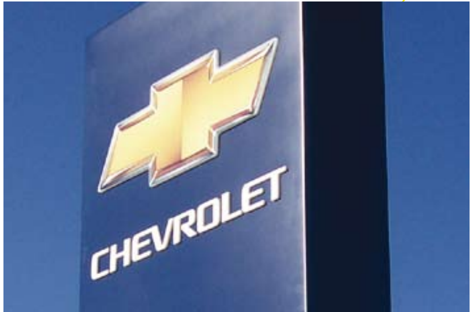
Ultra Large Scale Totem Sign