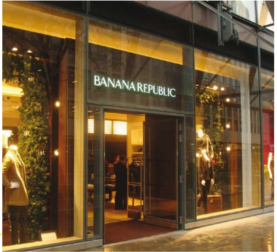
One New Change, London

Bolton Sign have been instrumental in developing the individual Gap brand, through their own unique style of signage. This has led us to supply not only in the UK but internationally, in countries such as Germany, France, Italy and most recently Kazakstan, Central Asia.